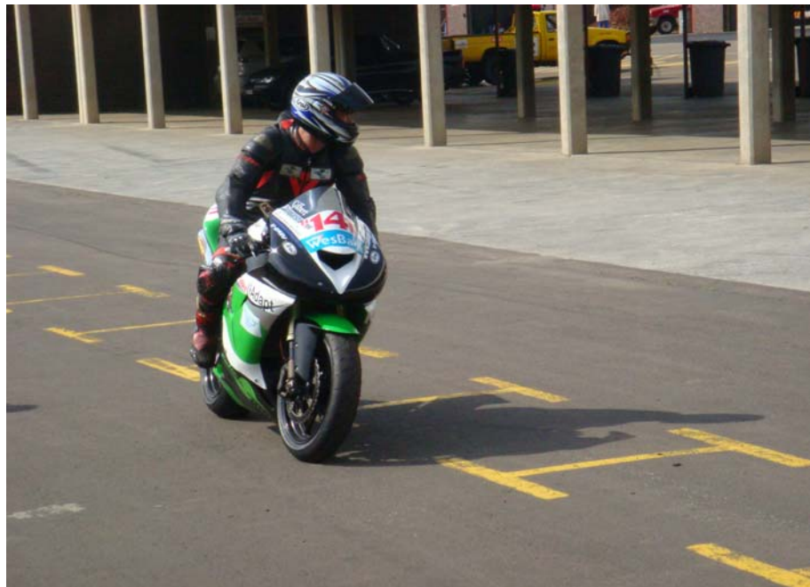
And this is a case of – where the hell do I get out on the track with this monster?