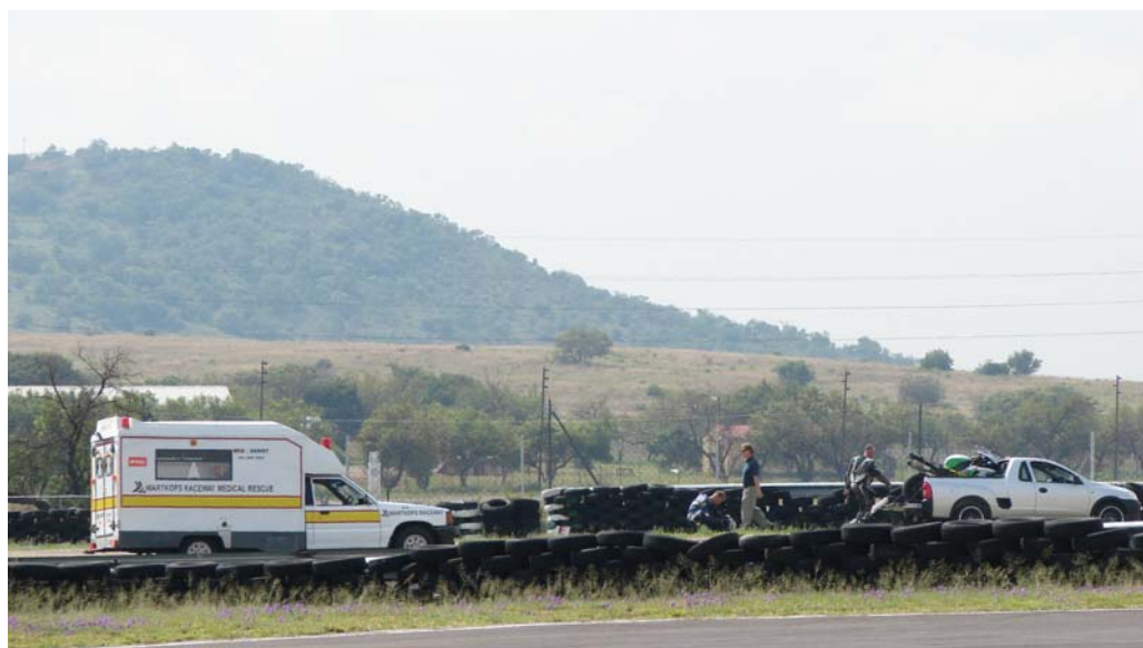
The infamous and dreaded turn 4 at Zwartkops claims another scalp

The esteemed ZX10 Masters Cup racer was the unfortunate person to dump one of the bikes and he has managed to cause some injuries to himself. As it is a dangerous sport this sort of crash is always something that will occur as it is only a question of when and not if.