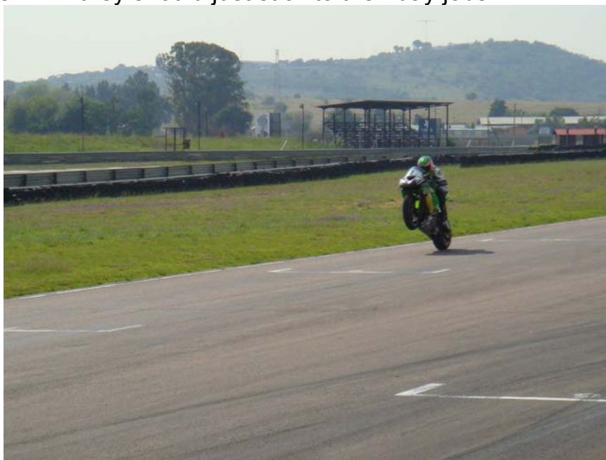
We all can see who this is and how it should be done.....#1

In some of the pictures below some people really know how to ride and others – well..... they should just stick to their day jobs.