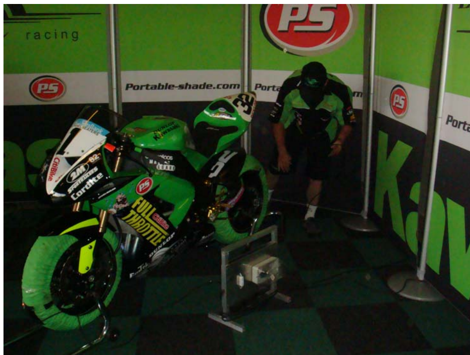
Even at a track day the pits are setup to reflect our professional approach.

For the day the Team provided the following bikes for all to test: