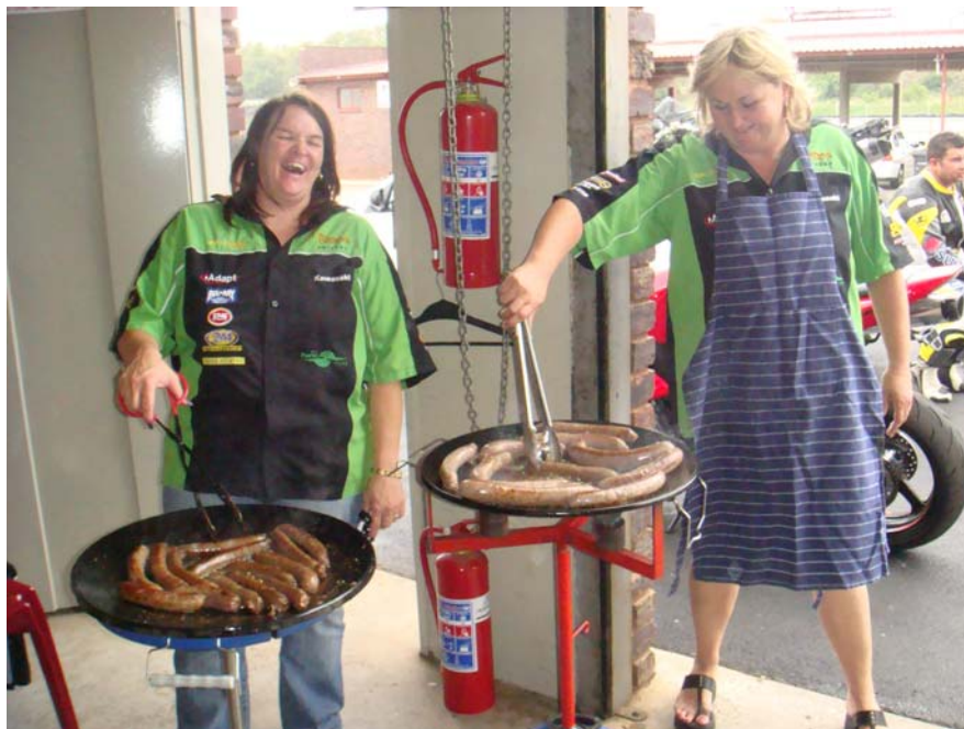
iAdapt admin staff multi tasking and wishing they were back at the office slaving over a computer.

For the day the better half of both companies managed to put on a fantastic spread to keep the riders well fed and rehydrated due to the heat (beers were not allowed until the last rider was off the track).