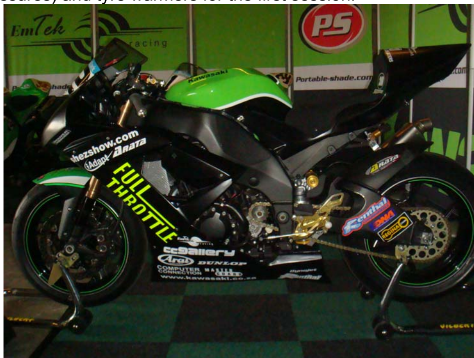
#2 spare bike of Shez

EmTek Racing prepared all the bikes in strict accordance as if it was a proper race day with a full race preparation taking place which included items such as new oils, new brake pads, gearing checked and good race tyres (including tyre pressures) and tyre warmers for the first session.