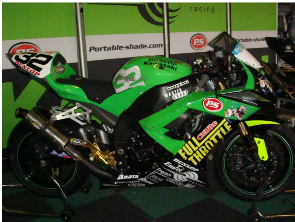
#1 Championship winning bike of Shez

EmTek Racing prepared all the bikes in strict accordance as if it was a proper race day with a full race preparation taking place which included items such as new oils, new brake pads, gearing checked and good race tyres (including tyre pressures) and tyre warmers for the first session.