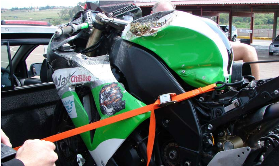
The results of turn 4 win over rider. Better luck next time.