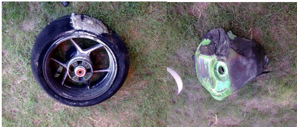
A spare tyre and fried tank for anyone??