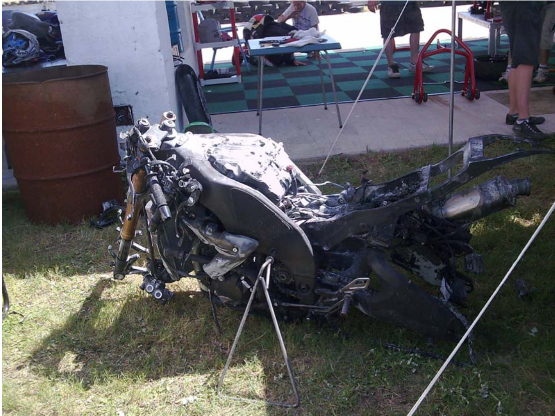
One slightly used ZX10 used by old lady to church on Sundays only

You be the judge of the following pictures: